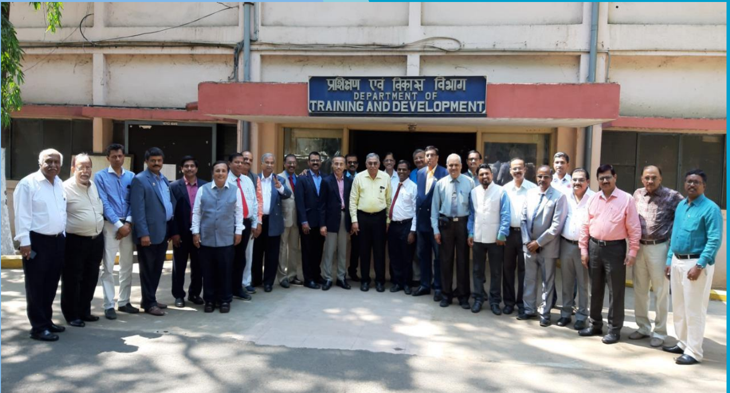
344 th National Council Meeting held on 21 st April, 2019 at HAL Training Centre, Hyderabad