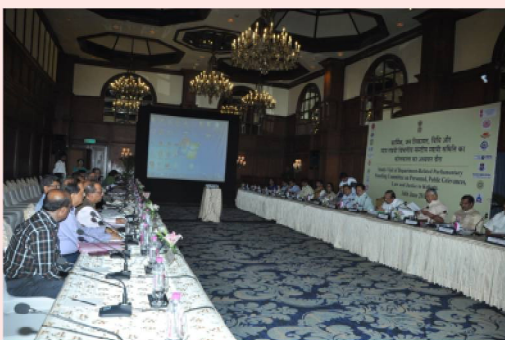
Hon'ble Members of Parliamentary Standing Committee during the Interaction Meeting with the Office bearers of National Institute of Personnel Management (NIPM); Indian Institute of Management; West Bengal State Public Service Commission; Administrative Training Institute; and the Centre for Studies in Social Sciences on 14th June, 2016 at Hotel Taj Bengal, Kolkata.

Photographs on the Interaction Meeting of Parliamentary Standing Committee with NIPM are given below for ready reference :-